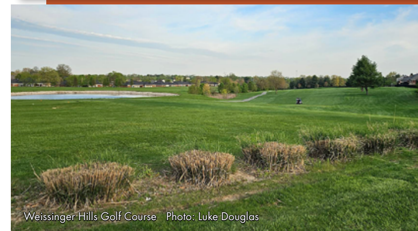
Weissinger Hills Golf Course