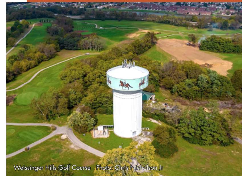
Weissinger Hills Golf Course