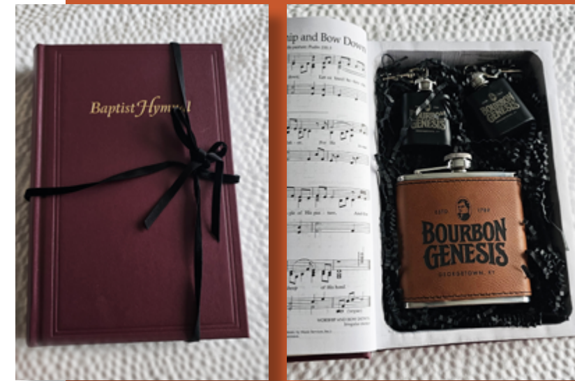
An unusual gift with a surprise inside!