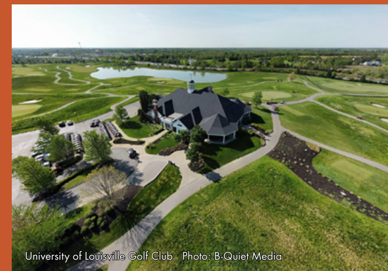
University of Louisville Golf Club